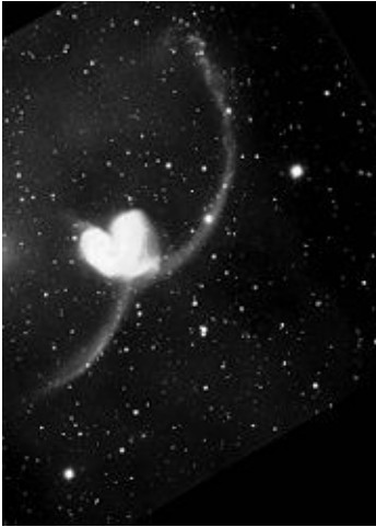
Figure 3 – The field Arp 244, another pair in strong interaction (NGC 4038 and NGC 4039). The tidal tails that emerge from both galaxies in the pair give the impression of insect antennae, hence the popular name of this system, “Antennae Galaxies” (Credit: Brad Whitmore/STScI).

constituents of the interacting system. Astronomy, the study of the locations of celestial bodies in space and time, is here supplemented by a physical law – Newton’s law of universal gravitation – and becomes authentic astrophysics.