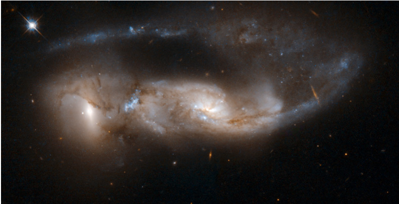
Figure 2 – The field Arp 81, a pair of galaxies in strong gravitational interaction. The galaxy on the left is NGC 6621 and on the right is NGC 6622. Arp 81 is 300 million light years from us. One of the main consequences of these kind of interactions is an increase in star formation in the galaxies (Credit: Hubble Space Telescope/NASA).

bined gravitational forces of the Moon – mainly this – and of the Sun on the terrestrial oceans.