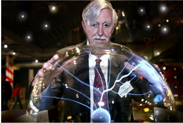
Figure 1 – Halton "Chip" Arp. [Overbye, 2014]

Arp sorted the general features of his Atlas into four large groups.